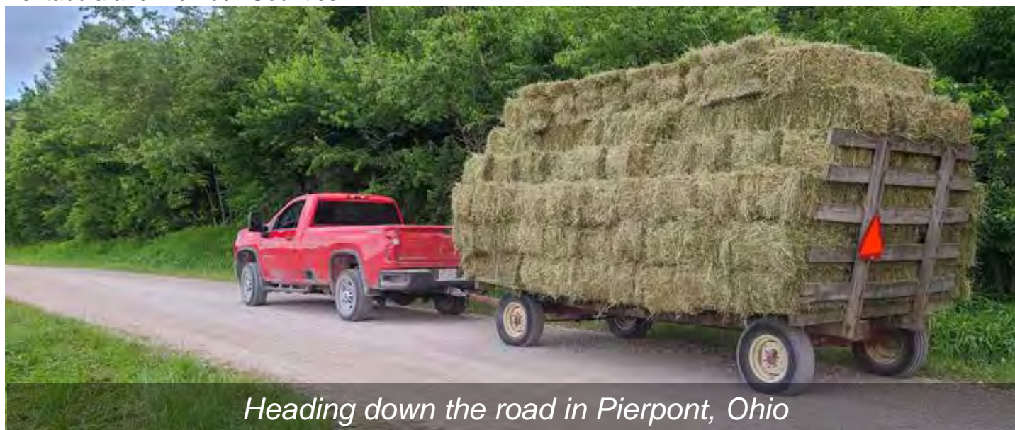
Heading down the road in Pierpont, Ohio